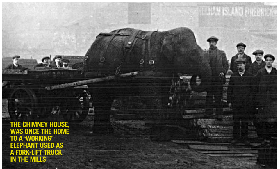
THE CHIMNEY HOUSE, WAS ONCE THE HOME TO A 'WORKING' ELEPHANT USED AS A FORK-LIFT TRUCK IN THE MILLS